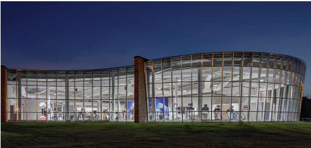
Butler County Health Care Center