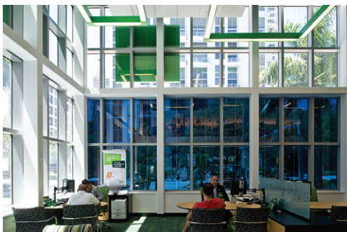
Electrochromic windows can be manually adjusted to change the reflective tint of windows, so occupants can allow more or less light into the work space depending on comfort and usage needs.