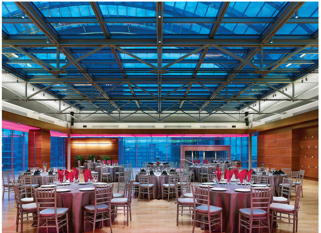
Kimmel Center for the Performing Arts