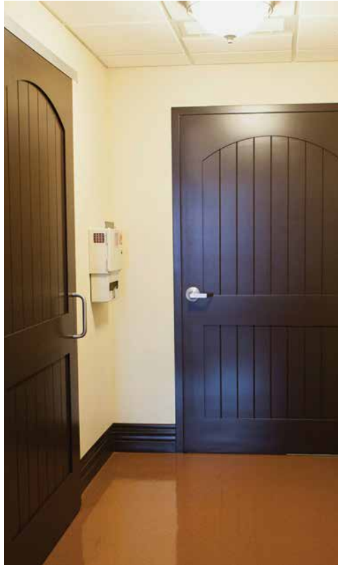
Arizona State Veteran Home

A custom designed MDF door created a striking complement within this Westport modern residence. This unique design epitomizes how creative design teams can go beyond a flush door to create a one-of-a-kind, remarkable modern feature within a home.