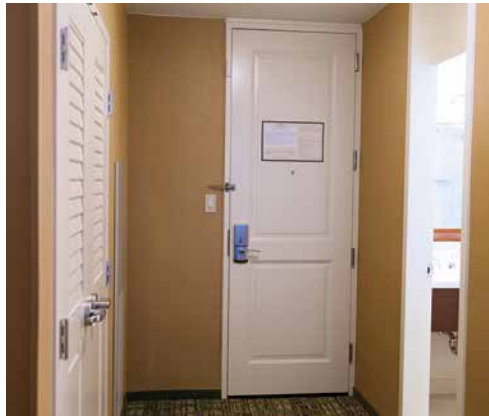
Whether it is a 20-minute fire-rated hotel door, 20-minute house-to-garage door, or a 60-minute fire-rated commercial door application, you can effectively create a safe and fire-rated MDF door for traditional, contemporary, or historic designs.

MDF fire-rated doors can be manufactured with any profile and configuration in paint grade or stain grade. They feature traditional stile and rail construction perfectly matched to the manufacturer's non-rated doors. In addition, many doors remain at the standard 1-3/4" thickness even on 90-minute ratings. Fire-rated glass doors are also available.