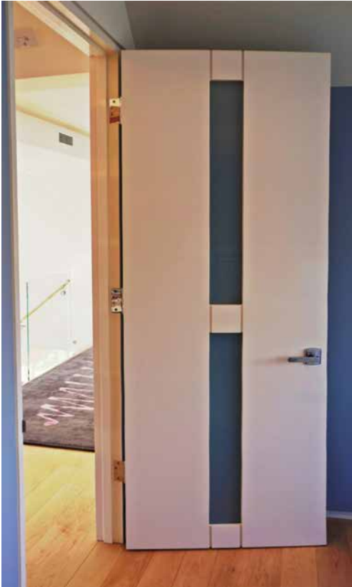
Modern Private Residence