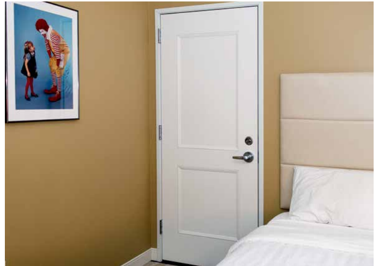
Ronald McDonald House

15 CPW redefined luxury in Manhattan when it was built in 2008, offering the new benchmark for what condo living in New York could be. The building was described by Vanity Fair as "The King of Central Park West" and is often referred to as one of Manhattan's most prestigious addresses. The doors custom designed for 15 CPW do not disappoint. The design combines three panels in the classic, traditional six-panel layout, and a full thickness convex panel, which gives the door a truly regal look.