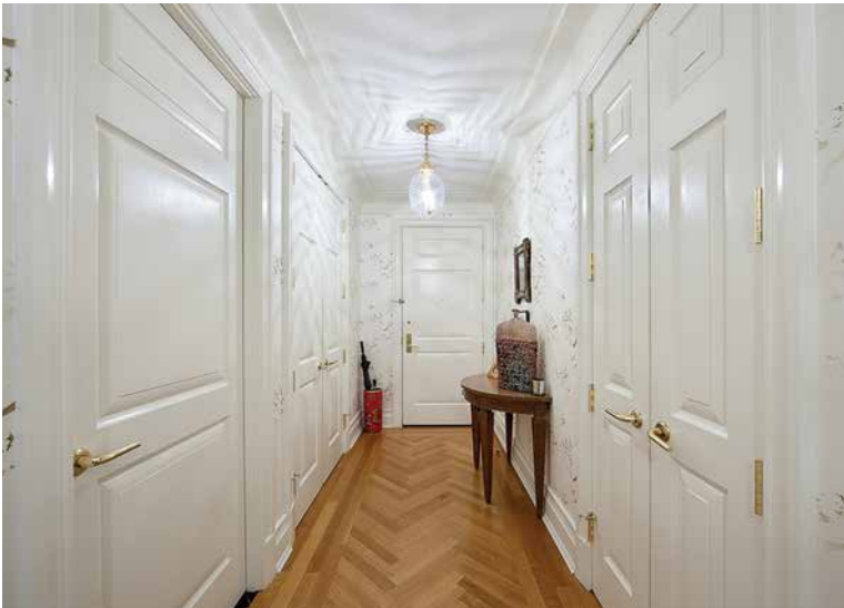
15 Central Park West

Many projects undertaken with the use of MDF doors have been very successful. Let's look at a few case studies where solutions have varied from simple to more complex. From homes to hotels, all of these projects have benefited from a cost-effective, aesthetic, and durable solution.