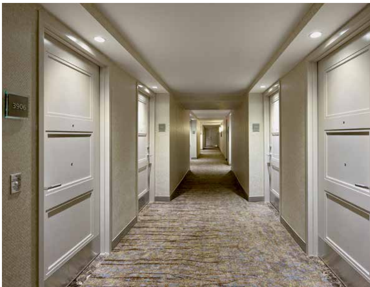
Westin New York Grand Central

At the world's largest Ronald McDonald House, located in Chicago, the families of patients at the Lurie Children's Hospital are housed here. Among the many details that were designed into this project, the elegant layout of the two-panel door combined with a custom sticking profile certainly creates a refined, contemporary, and notable look.