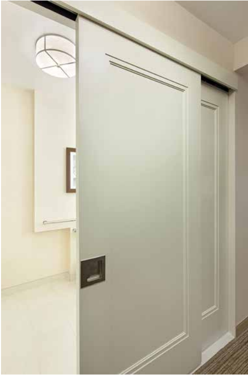
The industry will continue to see doors becoming more of a true project "feature" rather than an afterthought.