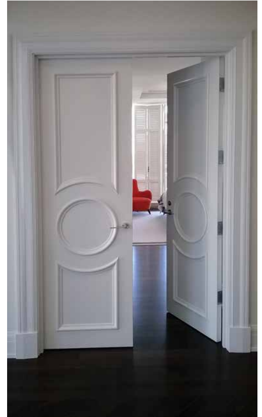
Ritz Carlton Hotel & Residence

A customized "southwest-style" door that was both durable and affordable was the result at this 120-bed skilled facility. This project is indicative of the national trend of creating a more comfortable, "non-institutional" feel for senior/assisted living/skilled nursing facilities. ADA compliant 3'8" wide unit entry doors were built to order. Elegant designs are the standard for architectural design teams using MDF doors.