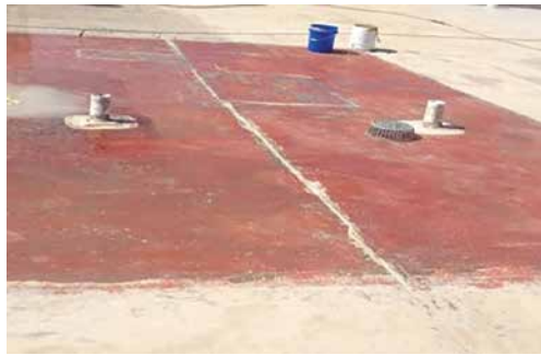
There are many different types of liquid-applied roof coatings and choosing the right product for a project deserves careful consideration to avoid problems or premature failures.

Self-adhered flashing tapes may also be used for detailing penetrations and seams. Whether to use a self-adhered tape or extra base coat and reinforcement is typically the contractor's choice.