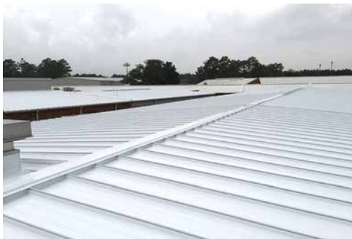
Aliphatic coatings are light stable and therefore exhibit excellent UV resistance, and also have excellent color retention.