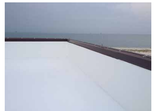
Polyurethanes have faster curing times, allowing for increased productivity and driving their widespread acceptance across the protective markets.

SEBS are limited by low solids content in the 50 to 60 percent solids range, meaning they have a high concentration of solvents, which is required to reduce viscosity to a workable level. Additionally, they have a strong odor, high cost, and are difficult to apply in low temperatures or high humidity.