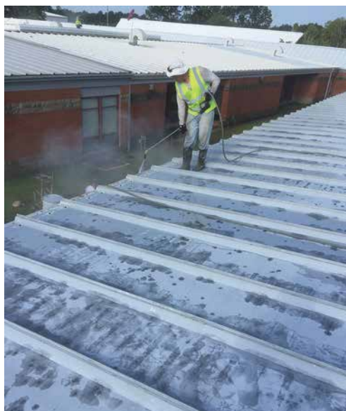
There are two keys to any successful liquid-applied coating application, surface preparation and dry film thickness; if the right amount of product is not put down, and if the surface is not properly prepared, it can lead to premature roof failure.

One-component and two-component aromatic and aliphatic polyurethane roof coatings have excellent initial as well as long term elongation. Some elastomeric roof coatings use plasticizers for flexibility but these can migrate out of the coating after repeated exposure to rain and heat. The long term elastomeric properties of polyurethane based roof coatings are achieved by the use of reactive resin components that do not leach out over time. This is a key attribute to retain the waterproofing and crack bridging capabilities of a roof coating system.