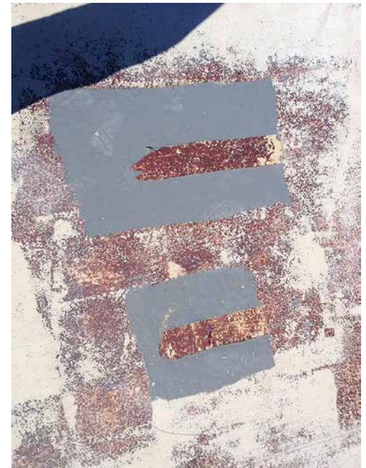
Primers can be used to darken substrates to reduce small amounts of residual moisture, as the darker surface will absorb more heat and dry faster.

problems that are not readily visible to the naked eye. Wet and/or damaged areas identified by an IR scan or core cuts must be removed and replaced with like insulation and coating. Each substrate should be washed with a bio-degradable detergent and appropriate power washing or scrubbing equipment. Be sure to consult the manufacturer of the sheet goods to determine how long you should wait to install a fluid-applied coating over new sheet goods.