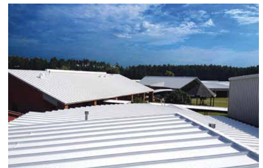
A high performance aliphatic polyurethane coating was selected to protect, preserve and extend the life of the Fountainbleu High School's extensive metal roofs.

Fontainebleau High School, located in the heart of St. Tammany Parish, was opened in 1994 with 775 ninth and tenth grade students. Fontainebleau presently serves a student population of 1,950 and is ranked as a top Louisiana public school when compared with schools of equivalent size.