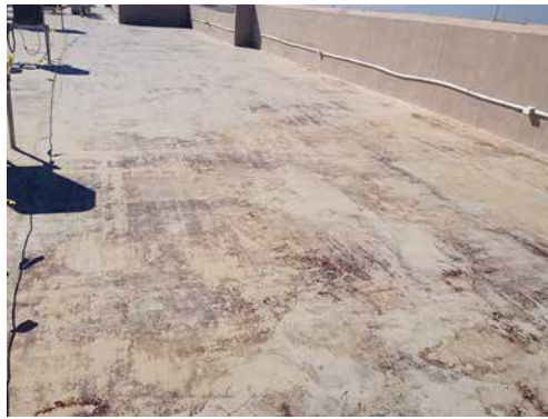
Liquid-applied coatings can be installed over virtually any type of existing roof substrate.

In addition, reflective coatings are often applied over darker colored or aged reflective existing roofs to help reduce energy costs. Fluid-applied coatings provide a seamless, monolithic surface that is fully adhered so that water cannot migrate beneath the surface. These coatings are lightweight, often less than 1/3 pounds per square foot, are self-flashing, and may qualify for immediate tax advantages based on prevailing tax code in your region related to energy saving building upgrades.