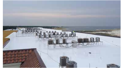
The decision to use an aliphatic urethane system was made because of the harsh UV exposure along Alabama's Gulf Coast

Holiday Isle is the largest condominium in Dauphin Island, AL. The existing roof coating was an aromatic urethane based coating applied over a concrete roof that had been installed for approximately 7 years. The contractor had adhesion test challenges with areas of the existing roof and had to mechanically abrade the problems to get to a sound substrate. The contractor prepared the substrate by removing the old aromatic coating down to either sound coating or to bare concrete. Once the contractor had a suitable substrate and adhesion tests were