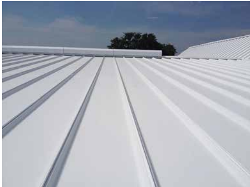
Reflective coatings are often applied over darker colored or aged reflective existing roofs to help reduce energy costs.

Therefore, a one or two coat liquid-applied roof membrane or a roof membrane with a weatherable topcoat can both be considered a roof system. A liquid roofing product with reinforcement such as fleece or other geotextile material is considered a membrane; if there is no reinforcement it is considered a coating. While reinforcement can be important to a roof system, it is worthwhile to consider the physical properties of liquid-applied roof coatings with and without reinforcement, as the physical properties can help determine what products are best suited to a specific application.