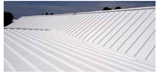
White and tinted roof coatings typically reflect 70 to 90 percent of the sun’s energy.

In addition, the success of cool roofs depends on latitude, altitude, annual heating load, annual cooling load, peak energy demands, and sun blockage by trees, buildings, and hills for the particular building. Cool roofs on buildings in some of the northern latitudes may not be appropriate. That said, whether or not a cool roof is appropriate in any climate depends on the building, its energy usage pattern, existing needs, and costs.